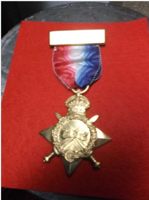
Obverse with ribbon bar

His service was brief - he was on strength with HMCS Niobe with infant Canadian Regular Navy when war was declared. He did not take to sea on their first patrol owing to ill health; he was sent to HMCS Diana a schooner and training vessel on August 11. He would remain on strength until October 22, 1914, when he was transferred to the shore establishment and invalided out November 6, 1914. On May 3, 1918, he received the War Badge Class "A" and March 31, 1920, he received the 14-15 Bronze Star. Unlike Army medal entitlement where or why did he not receive the British War Medal and Allied Victory Medal, according to the Royal Navy rules - he never put to sea for a minimum of a "two weeks" operational cruise making him ineligible for the War Medal and Victory Medal.