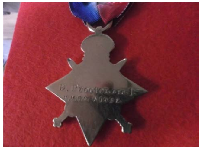
Reverse with naming